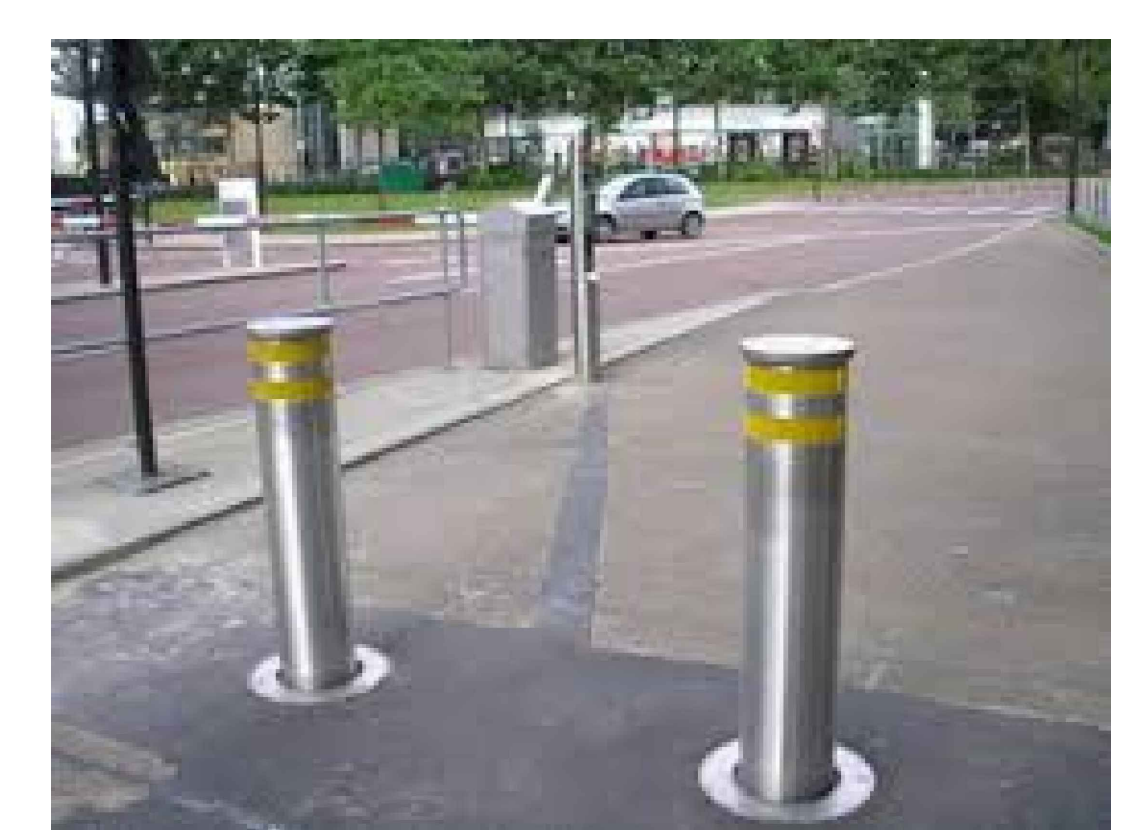
TYPICAL RETRACTABLE BOLLARD